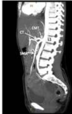
Figure 2: MIP (Maximum intensity projection) image depicting the origin of CMT (celiacomesenteric trunk), CT (celiac trunk), SMA (superior mesenteric artery).