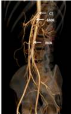
Figure 1: 3D volume rendered image depicting origin of CT (celiac trunk), SMA (superior mesenteric artery) and IMA (inferior mesenteric artery) from the ventral surface of aorta.