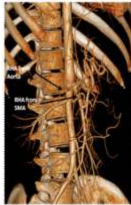
Figure 4: 3D volume rendered image depicting the two replaced right hepatic arteries (RHA).