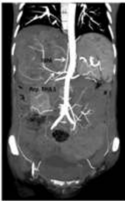
Figure 3: MIP (Maximum intensity projection) image showing Rep. RHA I (first replaced right hepatic artery from aorta) with RIPA (right inferior phrenic artery) as branch.