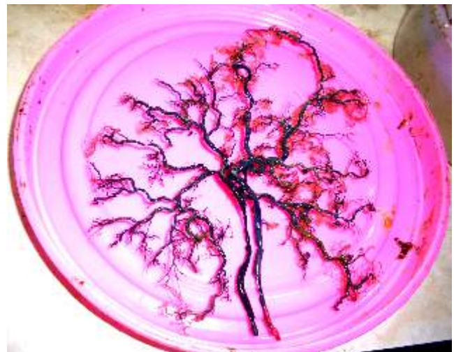
Photograph-4: Dispersed type of arterial pattern

RESULTS : We studied the normal pattern by corrosion cast. Out of 20 placenta, we found that 14 placenta i.e. 70% were of dispersed variety (Photograph 4) and 6 placenta i.e. 30% were of Magestrial variety (Photograph 5).