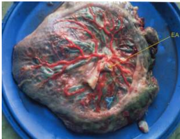
Photograph-1: Injection Technique – Red coloured dye injected in right umbilical artery.