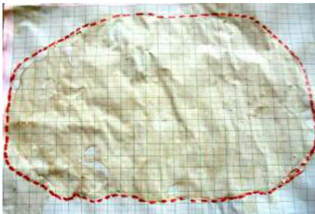
Photograph-2: Graph Method for calculating surface area of placenta

Placenta kept in 10% formaldehyde for 1 day then in 30% KOH for 7 days, casts were then ready and observed for arterial pattern. (Photograph-3)